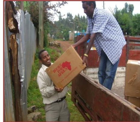
Books arriving at the HORCO office