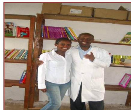
Teacher excited with the value of the books