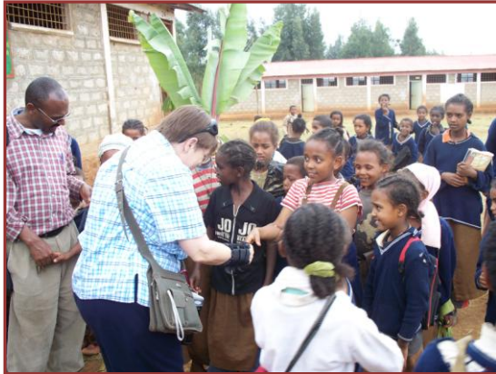
Visiting the school in Holeta, Ethiopia

Hope for Rural Children and Orphans (HORCO) has distributed 1,254 books to one primary school, one secondary school and one public library in Holeta town in the months of August and September, 2008. Holeta is part of West Shoa zone of Oromia Regional State.