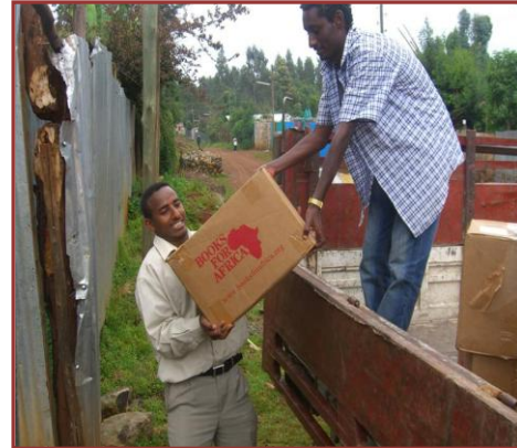
Books arriving at the HORCO office